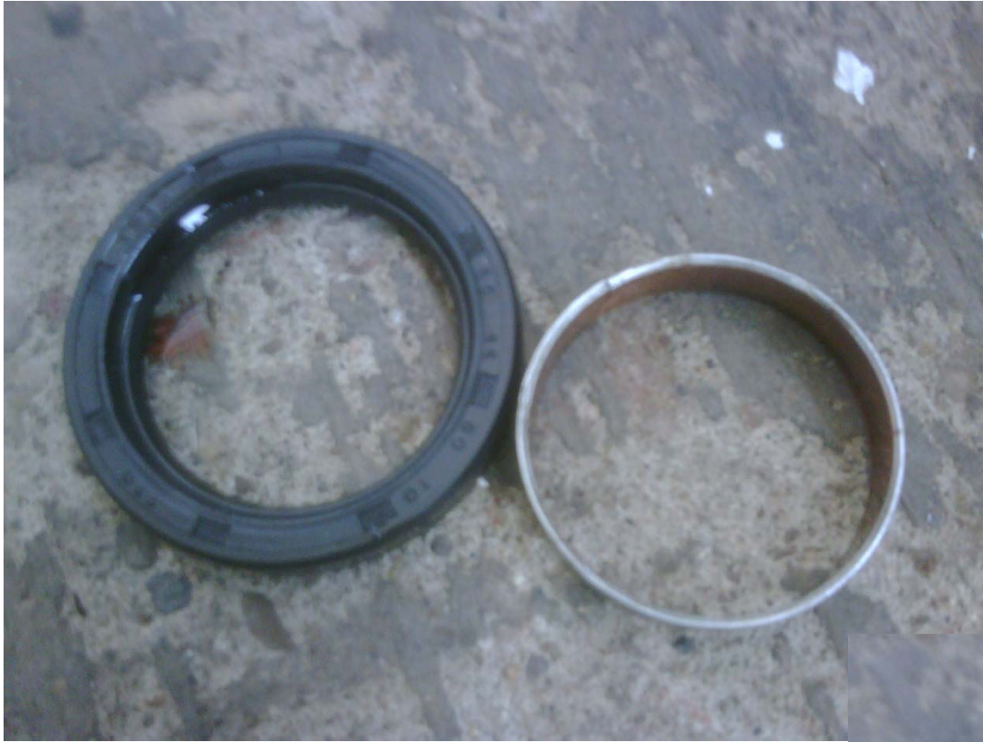
Retainer & Busing